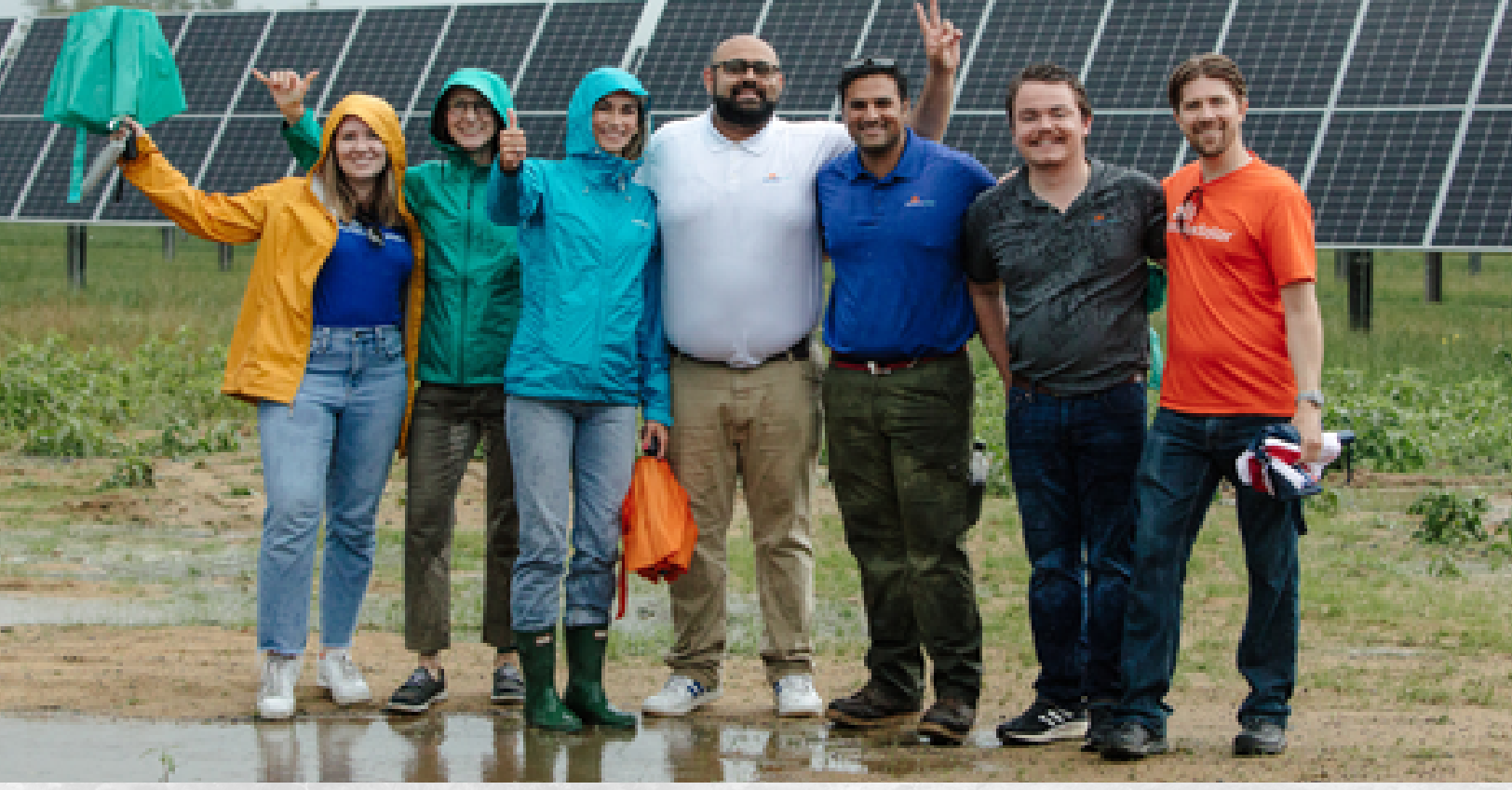
CWM Leader Nautilus Solar Employees in front of a recent project in Maine

https://www.climateworkmaine.org/webinar-november-15-2022.